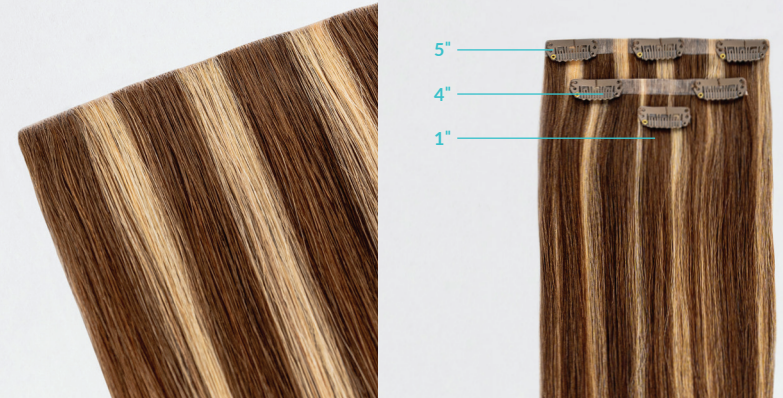
BLEND-INS CUT 16" Color #1B & 2 Widths 1", 4" & 5"