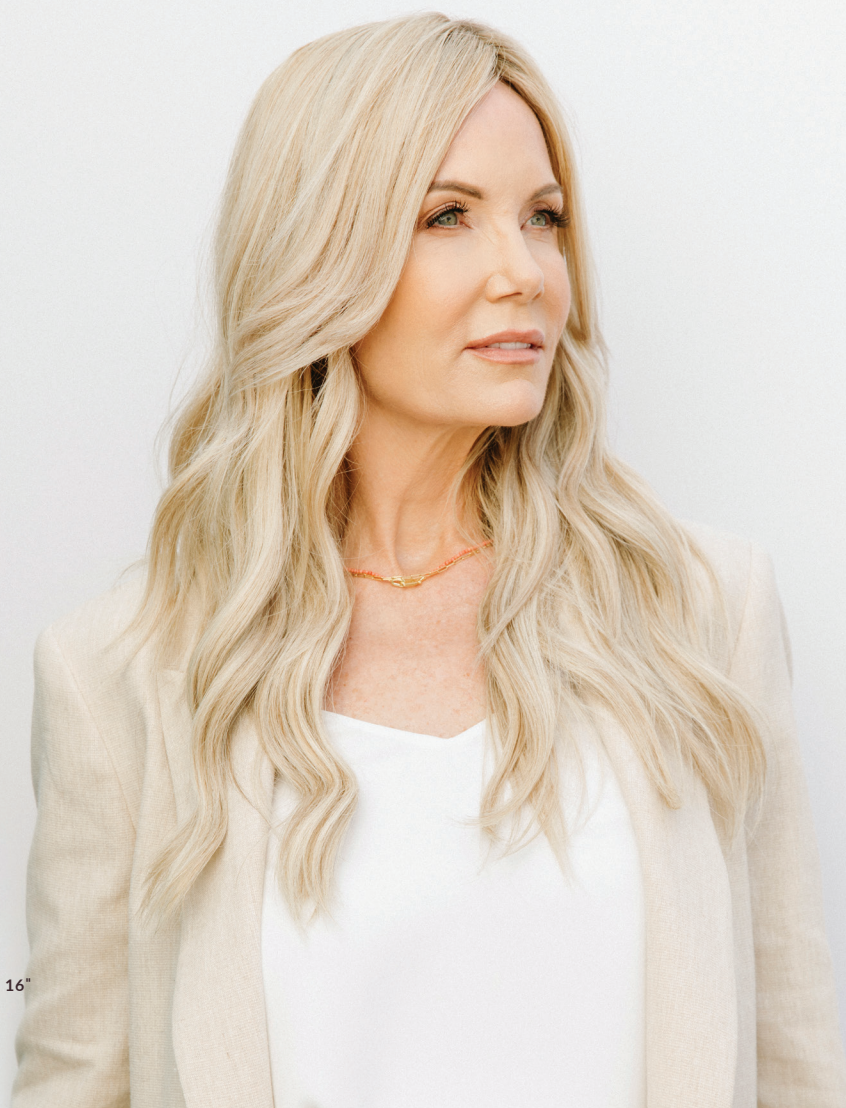
THE HYBRID FALL 16" Color #613